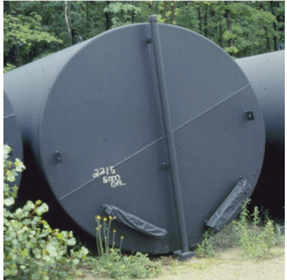
The bottom of the vertical monitoring pipe on the end of this double-walled steel tank connects to the interstitial space.

Interstitial monitoring detects the presence of liquid in the interstitial space. Double-walled tanks can be designed for continuous electronic monitoring or monthly visual inspection of the interstitial space for signs of leaks.